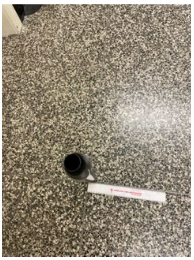
Pole assembly, top view: bottom 1-1/2", top 15/16"