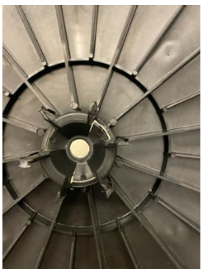
Base, bottom view, close-up of center