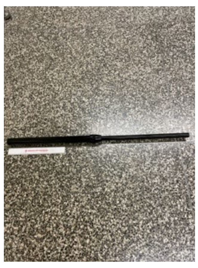
Pole assembly, open position: 37-7/8"