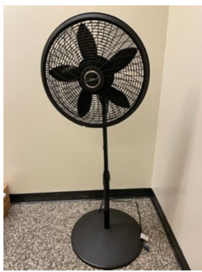
Lasko Pedestal Fan

Pole assembly material: Metal pole with plastic knob