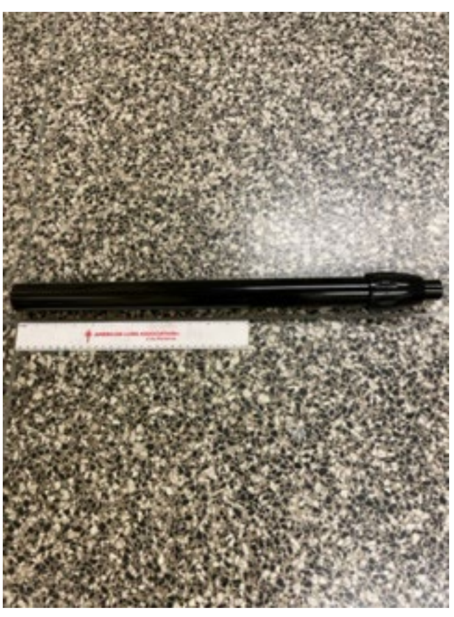
Pole assembly, closed position: 20-13/16"