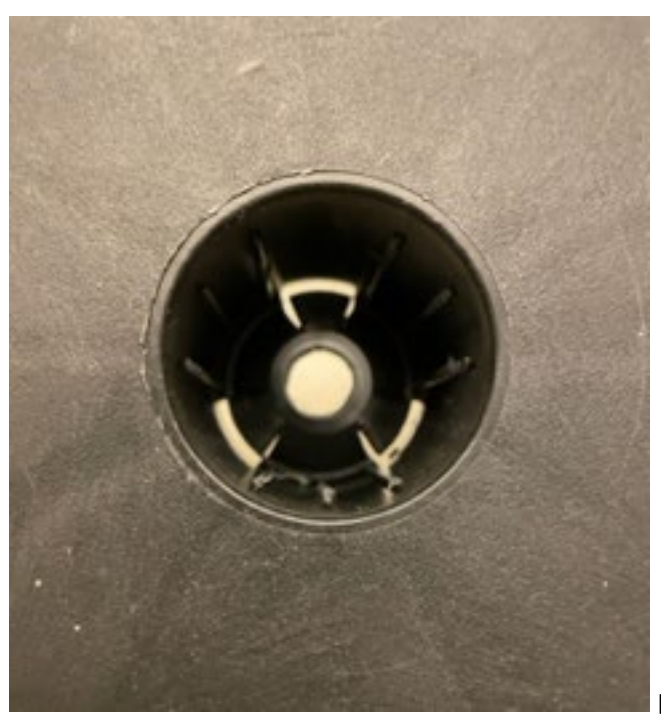
Base, close-up of center: 1-5/8"