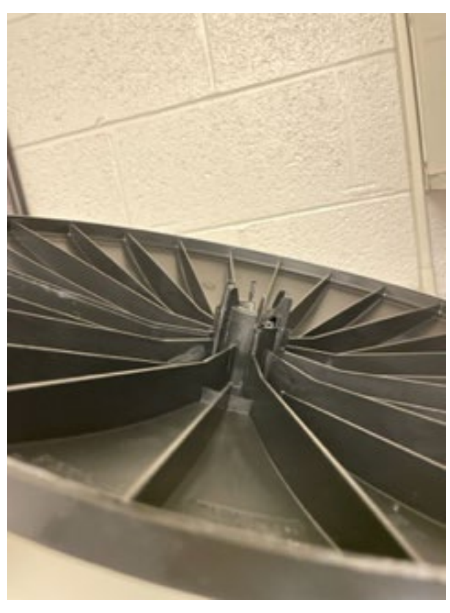
Base, bottom/side view