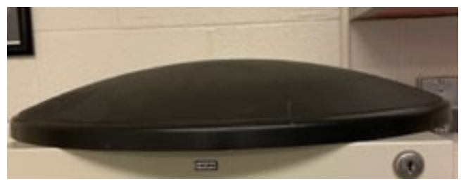
Base, side view: total height 3", straight edge ¾"