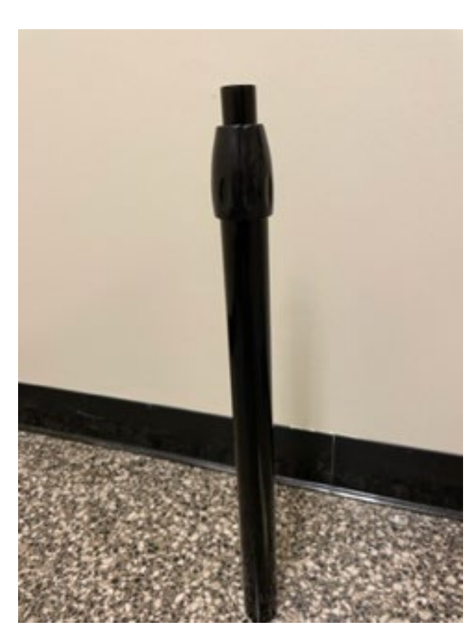
Pole assembly close-up view