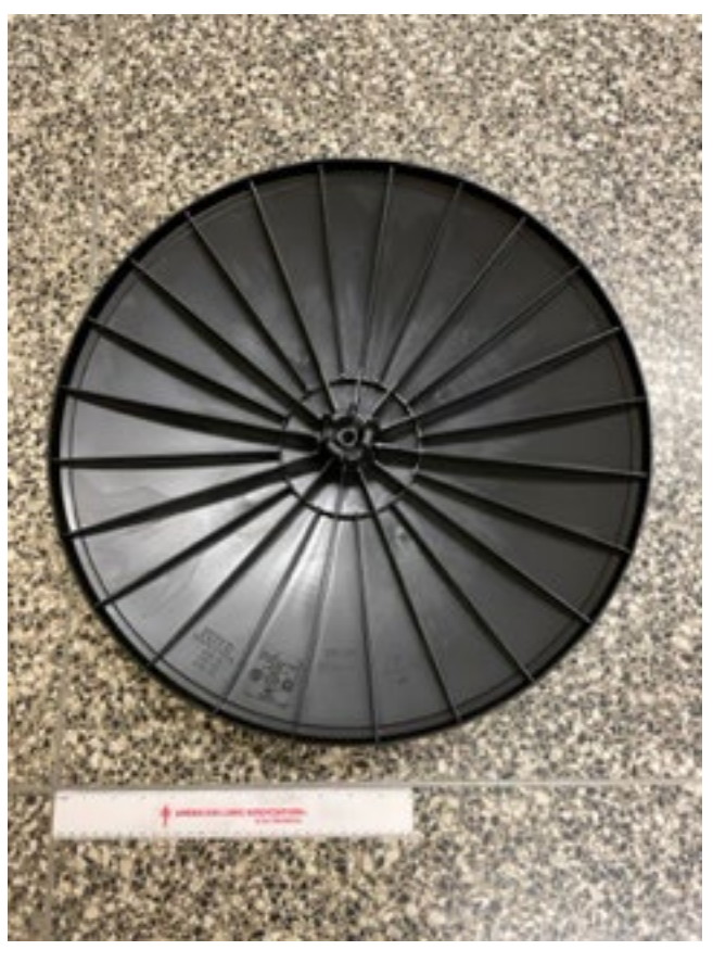
Base, bottom view